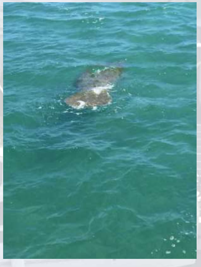
5 fingered hands!